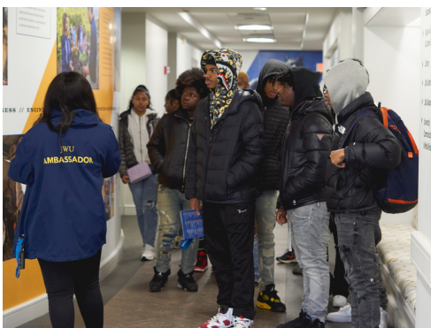
JCs and LITs on tour at Johnson & Wales University