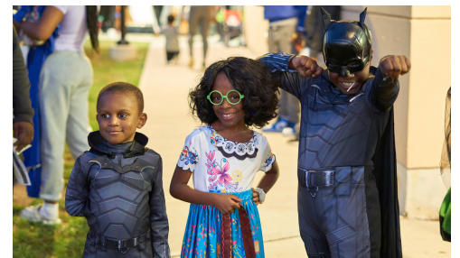
Children get ready for trick-or-treating