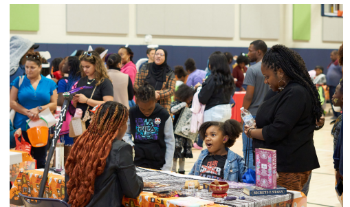
Child gets fortune read at Halloween Festival