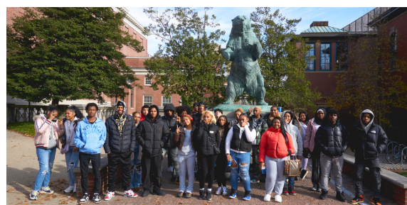
JCs and LITs at Brown University